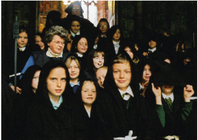
Young visitors adopting Benedictine habits

from the University. It is a great joy to see children enjoying their time in the Cathedral. In some cases, the children who visit have never been inside the Cathedral before, neither have their par-